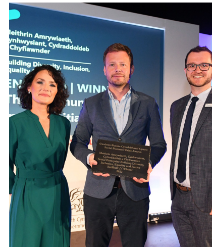
The fund supported the Social Business Wales Awards, sponsoring the Social Enterprise Building Diversity, Inclusion, Equity and Justice Award