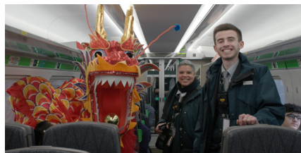
South Gloucestershire Chinese Association hosted a traditional Chinese Dragon dance for Lunar New Year