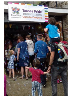
Totnes Pride is just one of the Pride events we supported across the GWR network