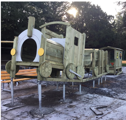
Dawlish Town Council constructed an accessible, inclusive Play Park with railway features

You can also find out more about the community rail movement on our website here: GWR.com/CommunityRail