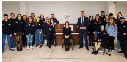
Plymouth Youth Music Service placed Plymouth's People's Piano on the station concourse