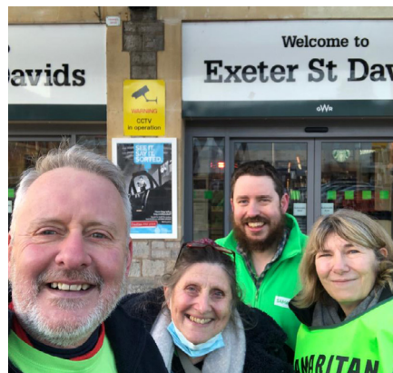
Samaritans recruited new volunteers and delivered events across the GWR network, including Exeter St Davids