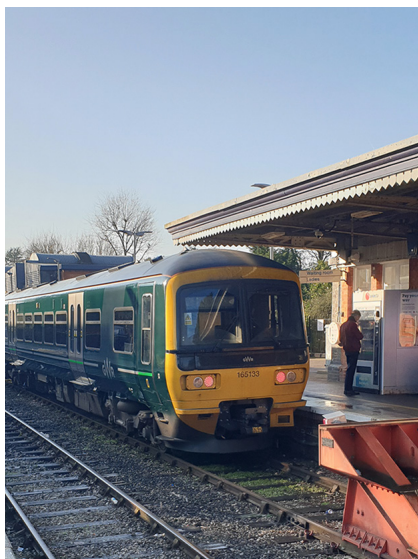
Buckinghamshire Council explored opportunities to improve access to Bourne End station by walking, cycling and public transport

Our Customer and Community Improvement Fund is designed to support small and medium projects that can be completed over the course of the 2023/24 financial year. We are particularly interested in schemes that benefit customers, increase rail travel, encourage carbon reduction, connect communities, people and places, support economic growth, promote inclusion and diversity, and educational programmes that support careers in rail or increase awareness and experience of public transport and rail safety. A good bid will show a strong level of community involvement and support and the proposal will have benefits that last beyond the duration of the project.