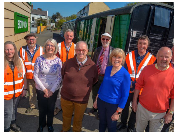
The Tarka Rail Association is developing a case for the extension of the railway from Bamstaple to Bideford.

We often receive a lot of high-quality bids, unfortunately we can't support them all with the funding we have available. All bids will be scored on the above criteria and there will be a review process to ensure projects are distributed across the GWR network and across the different areas we are supporting.