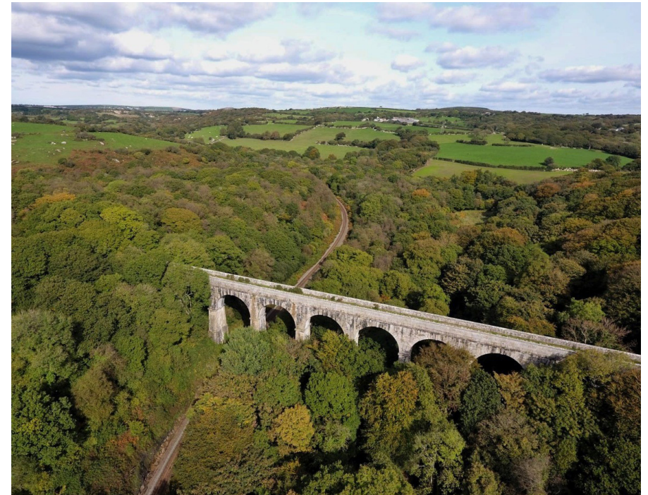
The Cornwall Heritage Trust ran a range of events celebrating the history and heritage of the Luxulyan Valley

We look forward to seeing a wide range of bids from across our network.